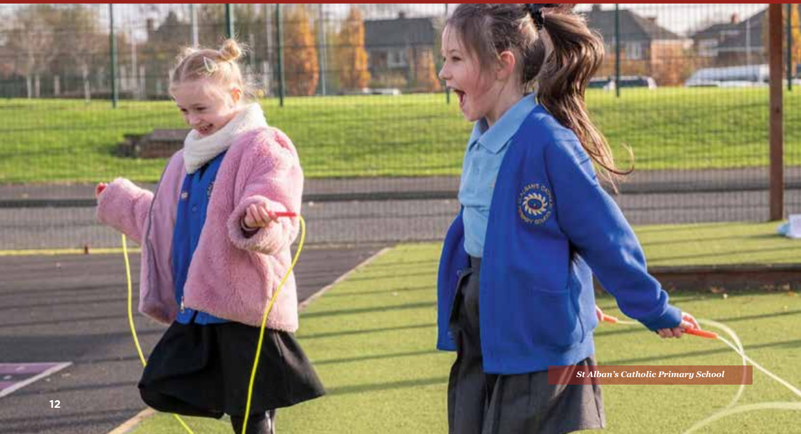
St Alban's Catholic Primary School

Sacred Heart Catholic High School Fenham Hall Drive, Fenham, Newcastle upon Tyne. NE4 9YH (0191) 816 3700 • enquiries@bishopbewickcet.org