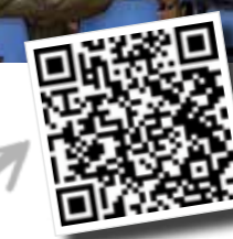
Tiny Happy People - Key talking tips for any age