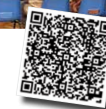
Activities to support children - Newcastle Hospitals NHS Foundation Trust