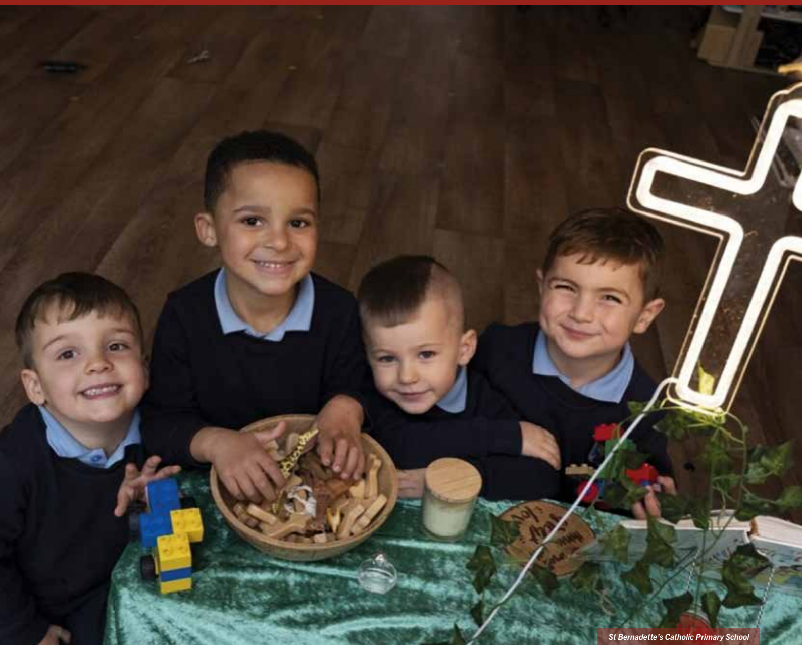
St Bernadette's Catholic Primary School

One Trust, One Family A great education has the power to transform lives