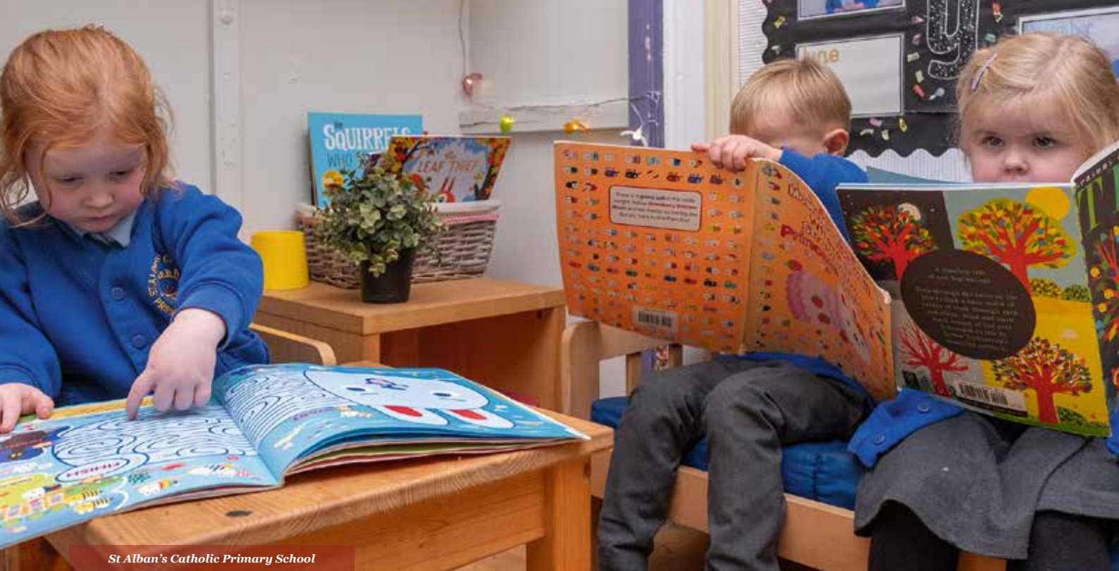
St Alban's Catholic Primary School