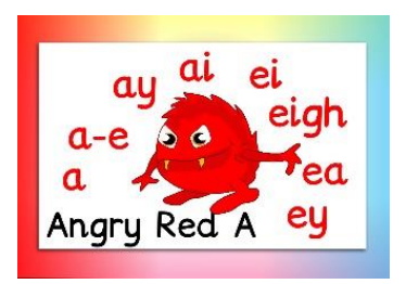
Long A sound