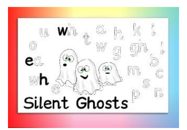
Silent Letters that have no sound