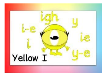
Long I sound