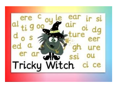
Tricky Letters that make a different sound