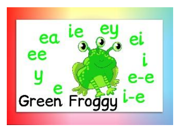
Long E sound