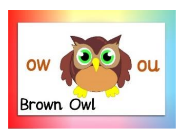
Long ow sound