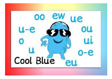
Long oo sound